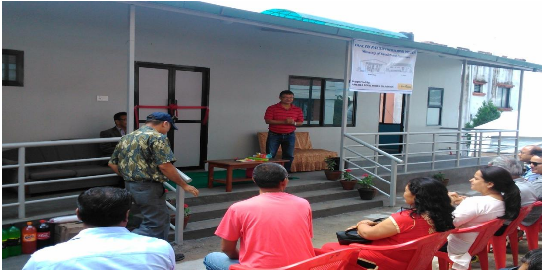
Pic: District Health Post, Chautara (Completed)