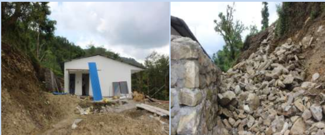
Fig: Most of the land allotted by the government are either landslide/flood prone area/hard to access which increases the cost of the construction (Retaining wall had to be constructed to protect the health post infrastructure).

Need of a retaining wall to preserve the prefabricated health post at Petku VDC