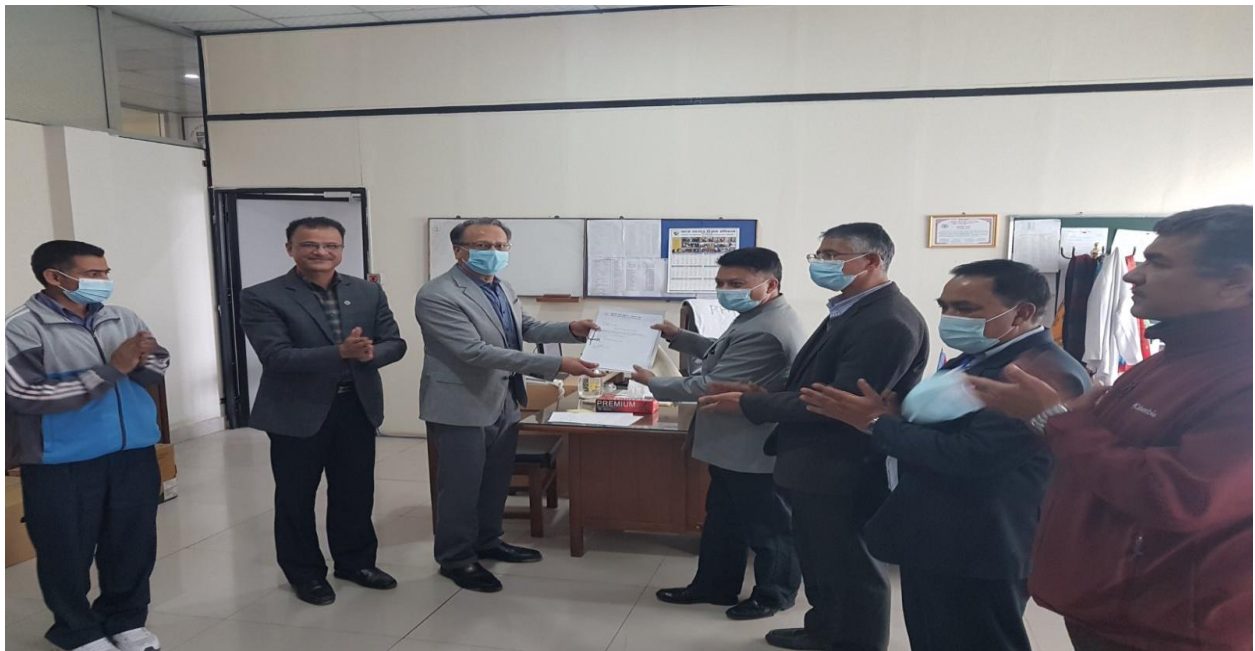
Picture: 6 Handover of Ultrasound documents to PAHS