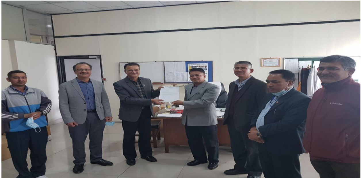
Picture: 5 Handover of Bronchoscope documents to PAHS