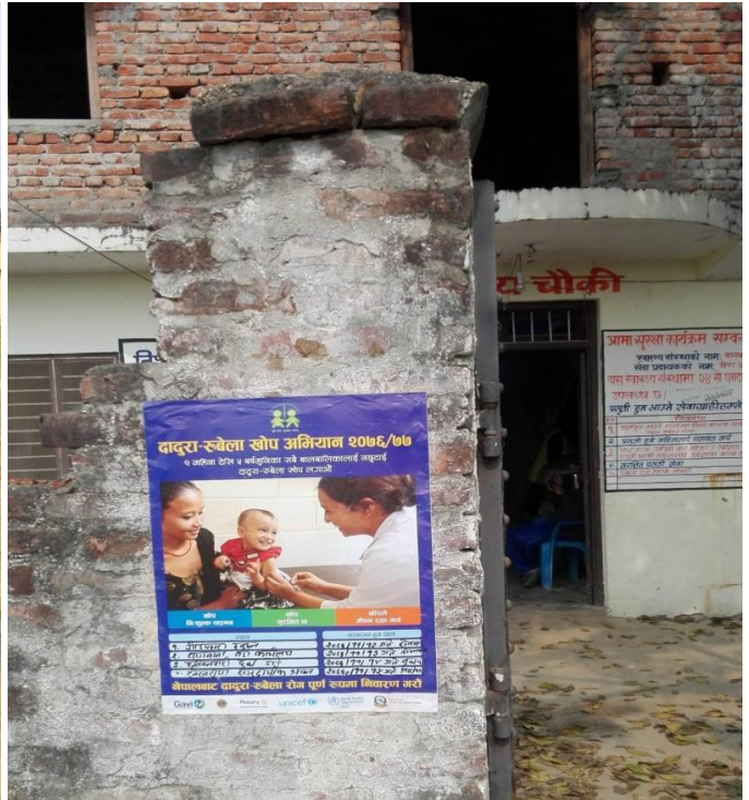
Monitoring the 'Measles-Rubella (MR) vaccination campaign of Government of Nepal' in our campaign site, Parsagadhi municipality