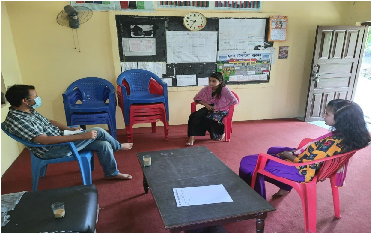
Students' reflection on 'I am a Child, not a Bride' Campaign

If I hadn't been in this campaign, I probably would have been married. Due to this campaign, I was able to participate in various programs relating to children and also won scholarships and rewards and all of them helped me become more confident and career-oriented. I aim to become a nurse in the future and educate people in my community about different issues relating to health.