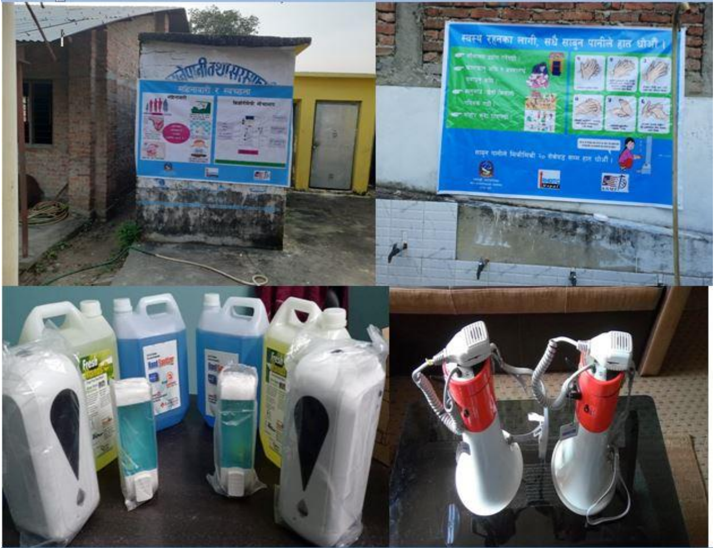
Activities conducted during COVID-19 pandemic; provided sanitizer, hand wash, flex and Hand –mike- speaker to both the schools.