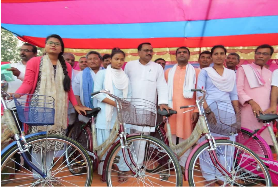
Bicycle distribution for the adolescent girls by the Parsagadhi municipality