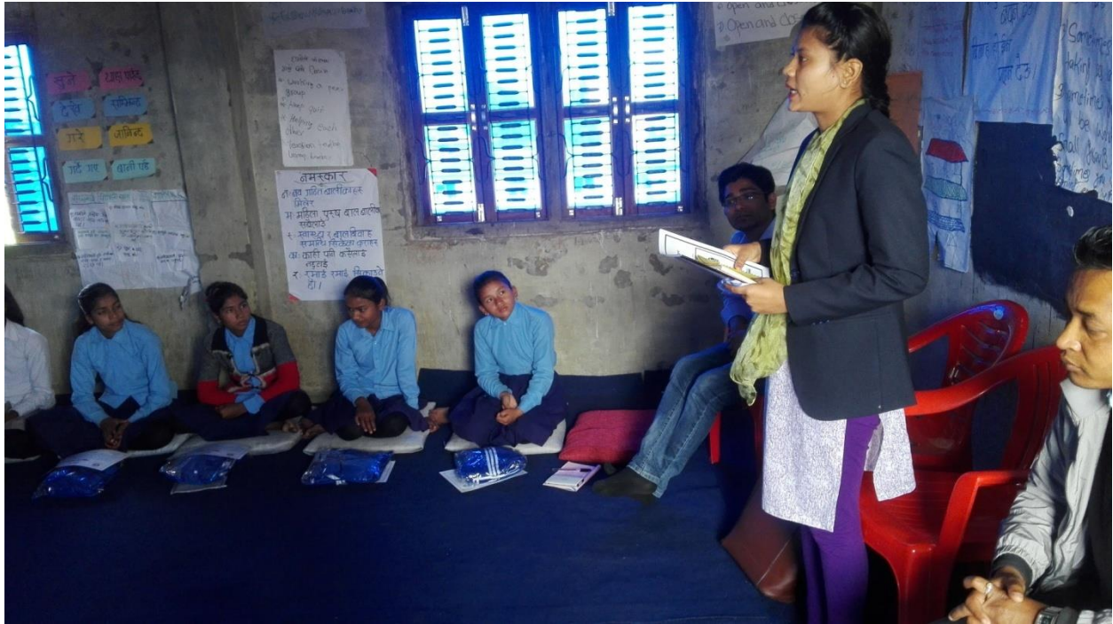
Deputy Mayor addressing the health orientation program organized by IRHDTN Nepal

This campaign has addressed the major issue of child marriage in our municipality in a remarkable way, thus playing a big role towards empowerment of girls. The issues of children and adolescents receive high priority in our municipality's programs and policy, and plans are being drafted accordingly. Although this campaign is based only in two schools until now, it has to be expanded to all the 13 community schools in our municipality. We commit to collaborate in order to make that happen.