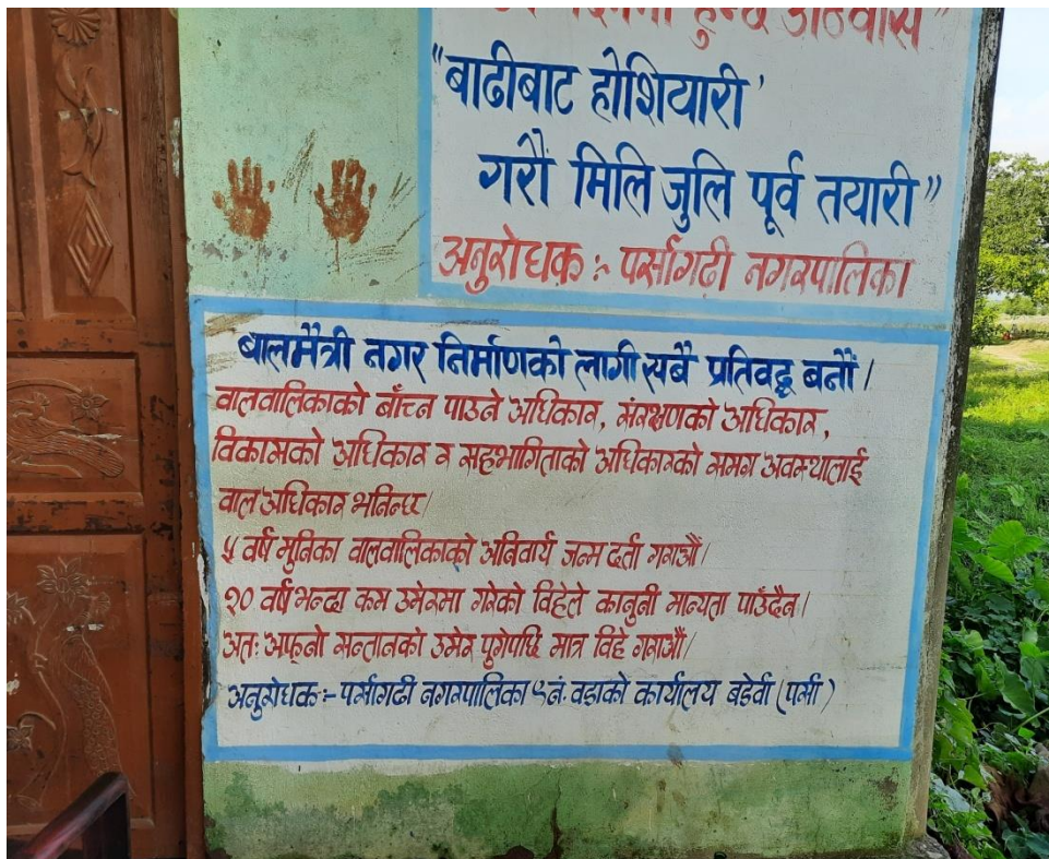
Wall Painting at Ward office:

Efforts to make local government more responsible and accountable towards the issue of child marriage.