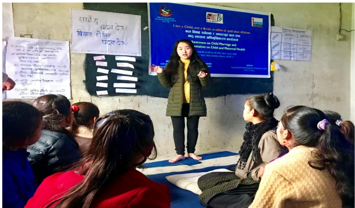
Orientation session on Child and Maternal Health