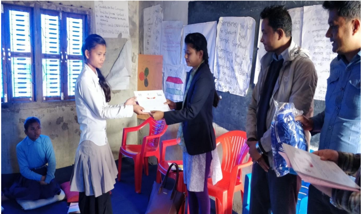
Uniform and stationeries Distribution to the adolescent girls taking part in the campaign