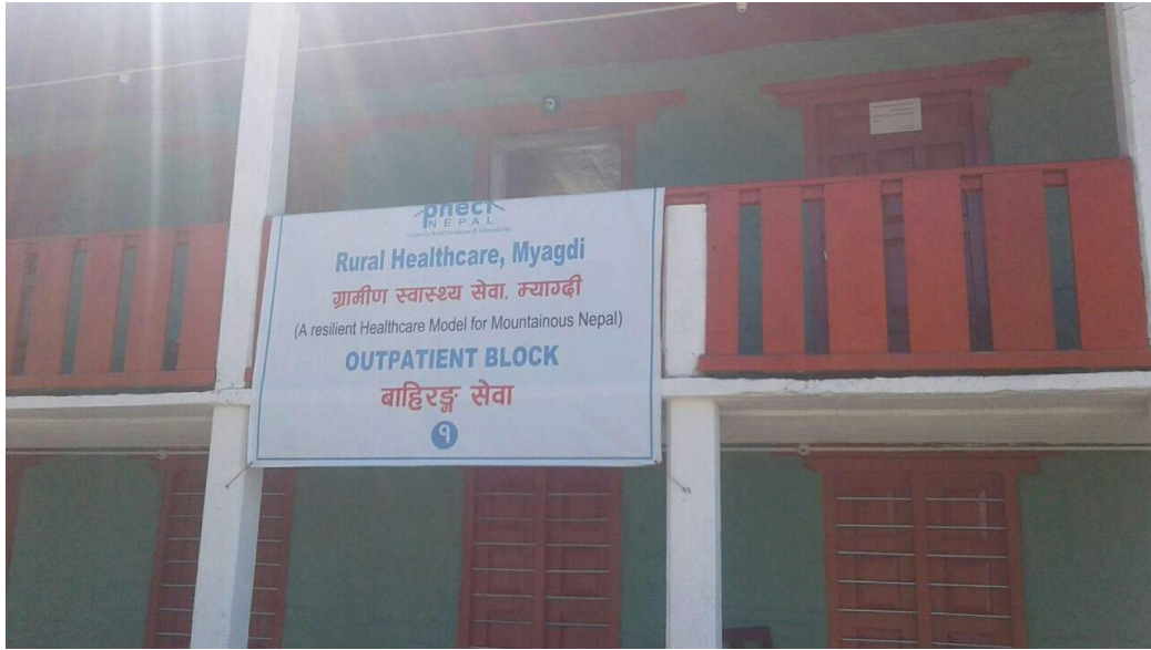
Figure 1: OPD of our Rural Healtcare Center