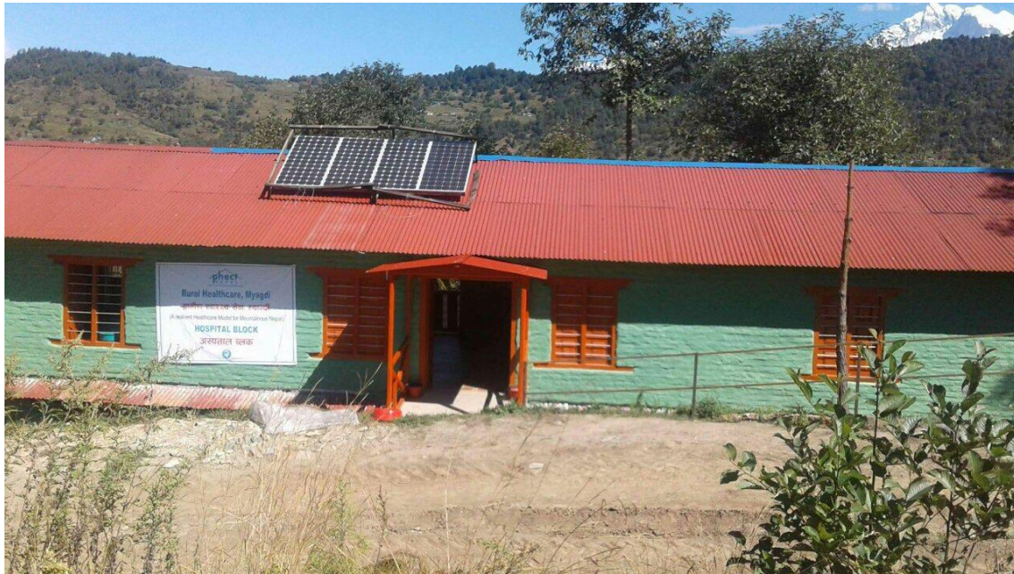
Figure 2:Overall view of our Center