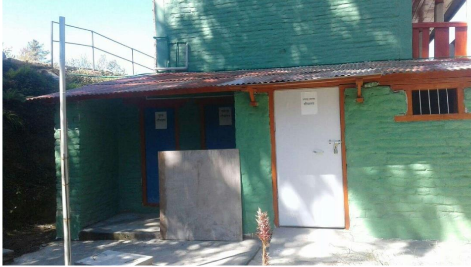
Figure 3: Rest rooms area; one for person with disability