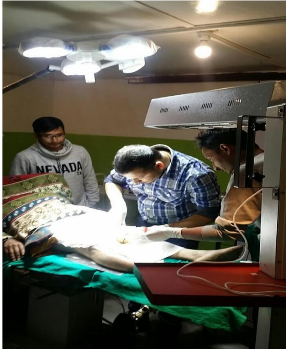
Figure 5: Surgical Procedure