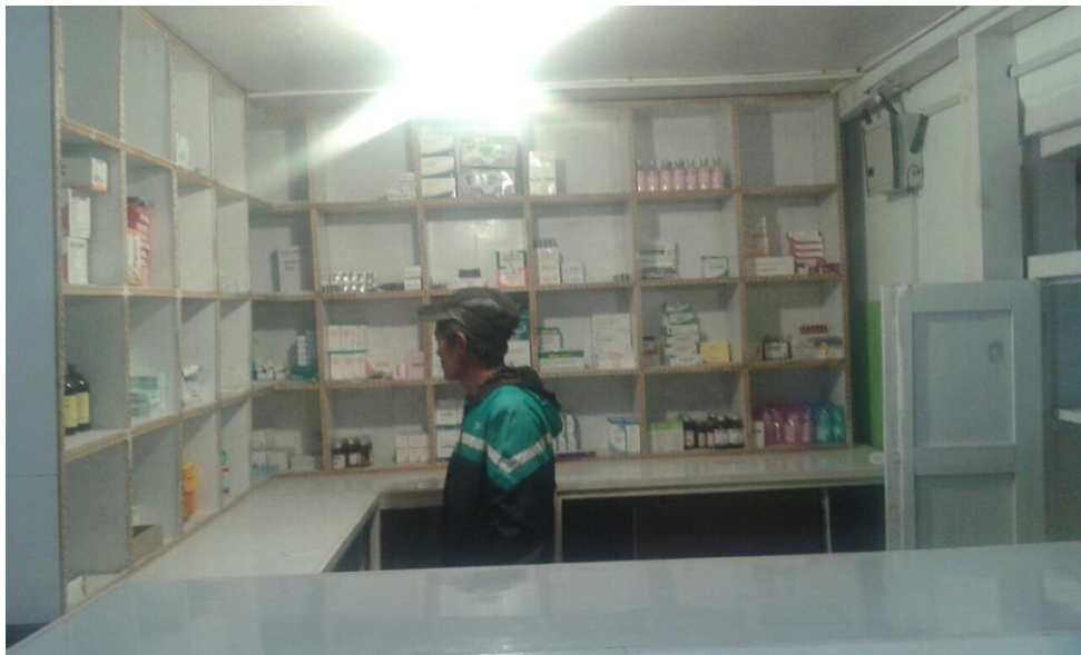
Figure 4: Pharmacy