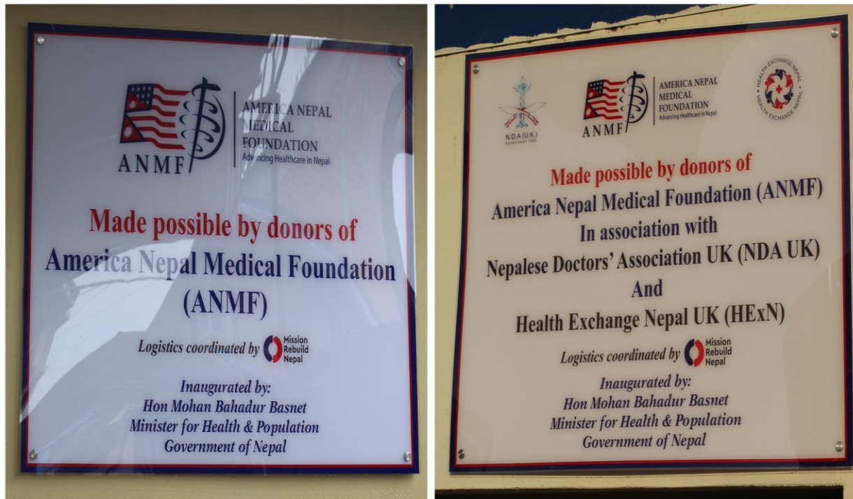
Board kept in order to acknowledging the donors of the oxygen plants

KIOCH-Damak children's Hospital- The oxygen plant was supported by America Nepal Medical Foundation (ANMF), Nepalese Doctors Association, UK (NDA UK) and Health Exchange Nepal (HEXN). The logistics support were provided by Mission rebuild Nepal.