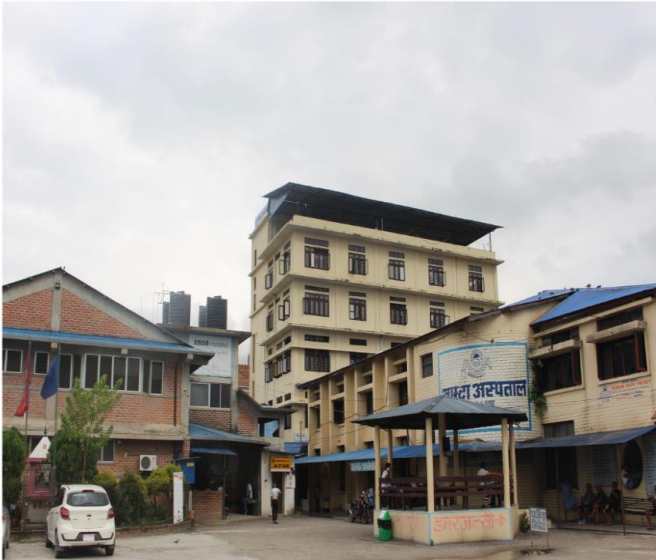
AMDAM Hospital, Damak