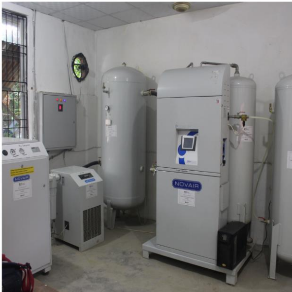
Oxygen plant at AMDA, Damak