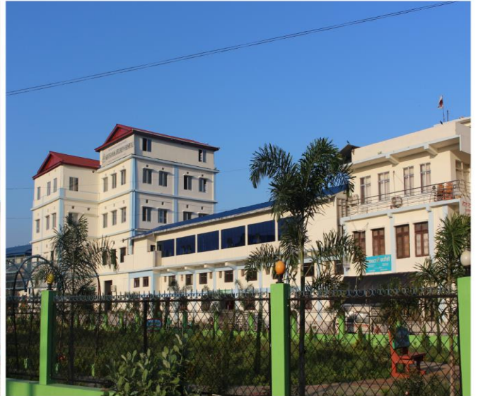
KIOCH-Damak Children's Hospital