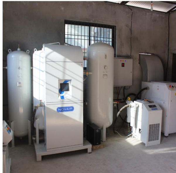
Oxygen plant at KIOCH, Damak