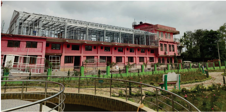
Figure 2 Light Gauge Steel structure installed for NICU and PICU