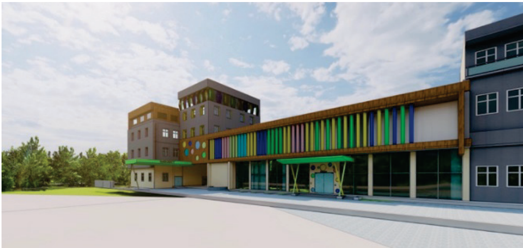
Figure 3 Future design of KIOCH Damak Children's Hospital